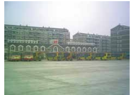
Huilongguan, Qinghe and Tiantongyuan Comprehensive Transport Planning in Beijing