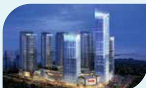
Shenzhen Unicenter 深圳市鸿荣源壹方中心