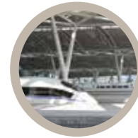
○ Review of Pedestrian Designs and Interchange Provisions for High Speed Railway Stations, China 中国高铁站行人设计与换乘枢纽供应的回顾