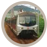
○ MTRC Network Studies, Extensions, Patronage Forecasts, Pedestrian and Station Studies, Hong Kong 香港铁路网络研究、扩展工程、客流量预测、行人及车站研究