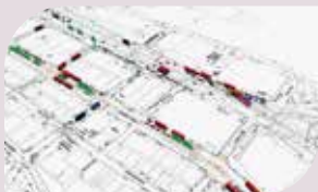
Hong Kong Tramways 香港电车