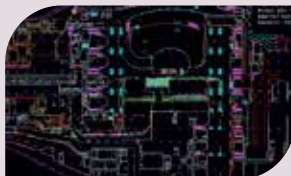
West Kowloon Terminus (WKT) 西九龙总站