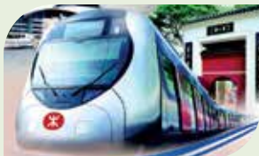
MTRC Shatin to Central Link, Hong Kong 香港铁路沙田至中环线(沙中线)