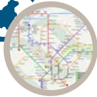
○ DTE Station Planning - Pedestrian Studies for 3 stations, Singapore 新加坡DTE车站规划 - 三个车站的行人研究