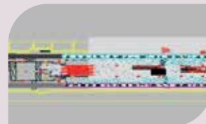
Station Planning, Kai Tak Station 启德站规划