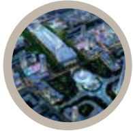
○ Pingtan High Speed Rail Masterplan, Fujian, China 中国福建平潭高铁总体规划