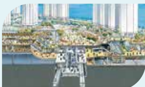
MTR LOHAS Park Station Property Development 香港铁路日出康城站物业发展