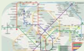
DTE Station Planning - Pedestrian Studies for 3 stations, Singapore 新加坡DTE车站规划 — 三个车站的行人研究