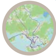
○ Review and Update of the Second Railway Development Study - Feasibility Study, Hong Kong 香港第二次铁路发展研究检讨及修订 - 可行性研究