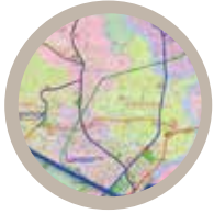
○ Ho Chi Minh City Metro Line 2, Vietnam 越南胡志明市地铁2号线