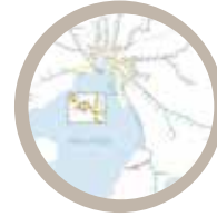
○ Melbourne Railways Patronage and Revenue Forecasting, Australia 澳大利亚墨尔本铁路客流量与收入预测