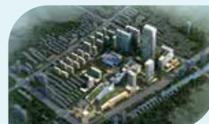
Nanjing AVIC City of technology 南京科技中航城