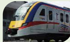
Kuala Lumpur Central Railway Station Design Studies 吉隆坡中央铁路站设计研究