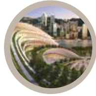
○ Express Rail Link (XRL) (Hong Kong Section) 高铁香港段