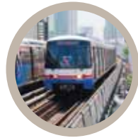
○ BTS (Skytrain) patronage and Revenue Forecasting, Fare and Affordability Studies, Thailand 泰国曼谷大众运输系统 (BTS) 客流量及收入预测· 票价及可负担性研究